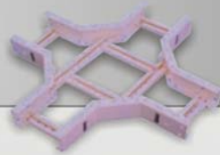
Pultruded FRP Cable Trays

Unchanged Profile with Greater Strength & Durability