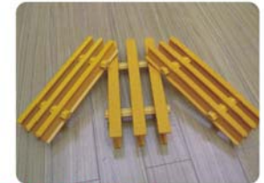
Pultruded FRP Gratings