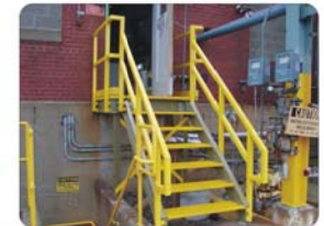
Staircase with Handrailings