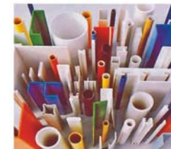
Pultruded FRP Profiles